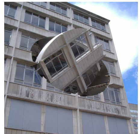
Richard Wilson "Turning Over the Place" 2007