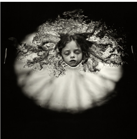
Sally Mann "At Warm Springs" 1991